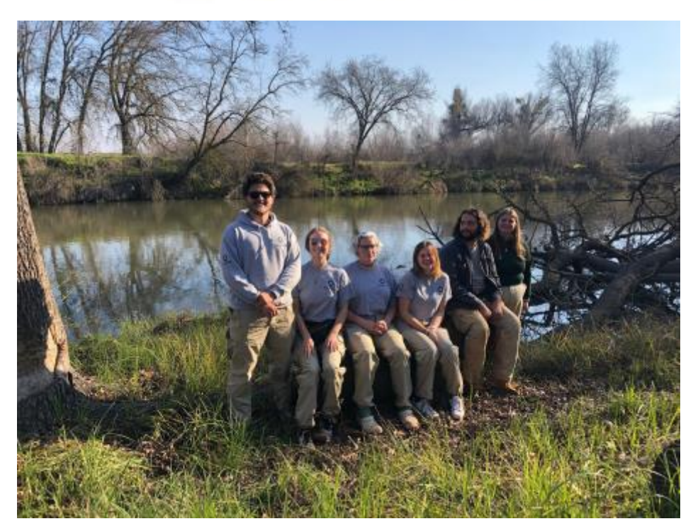
1 - Americorps Team of 8 Jan-April 2022