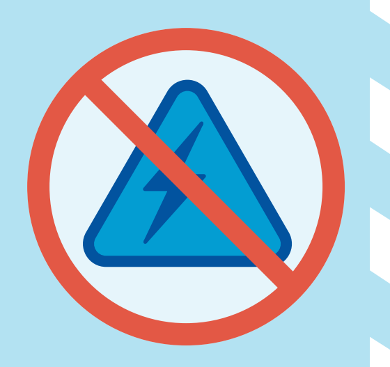
Buy ice to keep food and doesn't need cooking. or medicines in coolers.